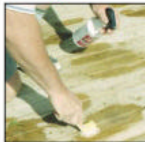
Spot removing and cleaning with Sun Frog Composite Deck Cleaner